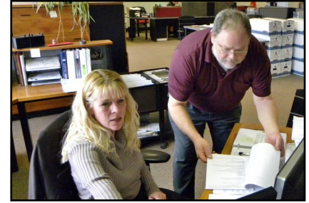
Members of the Tramont Sales and Service Team.