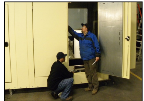
From left: Tramont engineers work on a tank design. 9000-gallon Sub Base Tank under construction. Final inspection of Sound-Attenuated Enclosure Package.