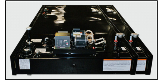
Top: Sub Base Tanks ready for shipment from Tramont. Left: 60" High Sub Base Tank. Right: Sub Base Tank in optional Day Tank configuration.