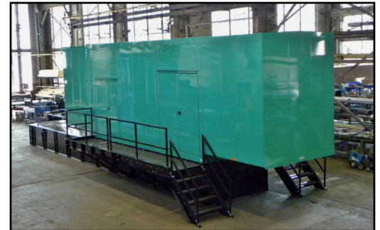
Sub Base Tank/Enclosure Package with Stairs and Walkway.