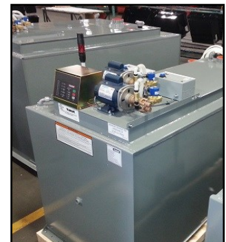
Right: TRS Day Tank with optional duplex pumps and visual alarm.

TRAMONT AND THE UCA GROUP: Tramont Manufacturing is a member of the UCA Group of companies. Headquartered in Elgin, Illinois, the UCA Group operates manufacturing and engineering companies in North America, Europe and Asia. At Tramont we are building on our past success by drawing on the UCA Group's broad-based resources, skills, knowledge, and purchasing power.