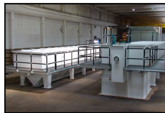
From left: High Voltage Enclosure, Locomotive Fuel Tank, Oil-Water Separators.

MOTIVE ENERGY THE WORLD OF POWER AND MOTION A DIVISION OF TRAMONT MANUFACTURING LLC