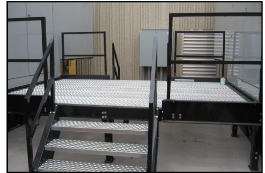
Stairs and Platform installed between gensets.

The completed unit can be shipped anywhere, ready for installation.