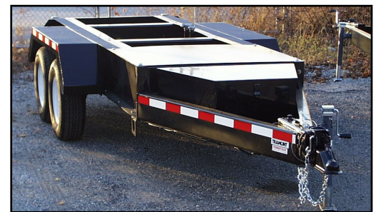
Trailer prior to mounting of genset.

Tramont POWERTRAK™ Trailers provide an onboard fuel source for mobile standby power applications. Trailers meet D.O.T. standards. Order as a stand alone unit, or packaged with your genset and Enclosure. Available in single, dual or triple axle design. Trailers include DOT/ICC lighting with six-pole connector plug; adjustable height pintle/ball hitch; adjustable front jack stand and two adjustable rear jack stands; heavy duty fenders coated with non-skid material on top surface and electric all-wheel brakes. Optional features available.