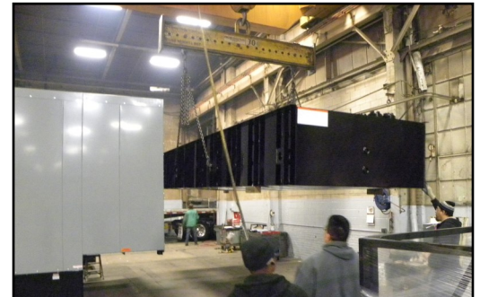
Sub Base Tank is moved into position prior to packaging with Enclosure.

Motive Energy, a Division of Tramont Manufacturing: Motive Energy designs and manufactures precision components used in critical applications. Industries served include power generation; utilities; alternative energy; passenger and freight locomotives; mining machinery; military; infrastructure and more. Products include electrical and mechanical enclosures, oil-water separators, fuel tanks and custom fabricated components.