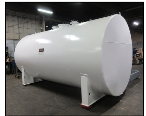
Rectangular and Cylindrical Main Tanks.