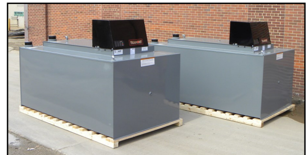
Above: TRS Day Tanks with optional weather resistant covers.