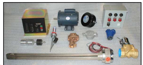
Selection of Day Tank and Sub Base Tank components.

Tramont offers an extensive selection of parts and accessories for all product lines, including Day Tanks, Sub Base Tanks, and Enclosures. If we built the product, we can supply the replacement part or upgrade kit.